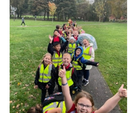
Year 5 had a fantastic time at the Belgrave Fire Station 'Safe and Sound' event this week. They took part in a variety of informative and interactive activities delivered by: