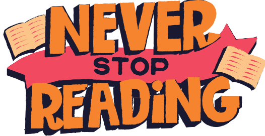
Our most popular children's book lists

But it doesn't stop here... our aim for our fluent readers is for them to develop a love of reading by having access to a range of quality text. Please encourage your children to continue to read widely and often - there is no age limit on reading! Older children still enjoy being read to too and we read aloud to children in every class, every day at Two Gates. A book makes a wonderful Christmas gift; for ideas and information visit https://schoolreadinglist.co.uk/ - where you can easily find books for all ages and interests! Keeeeeep Reading!